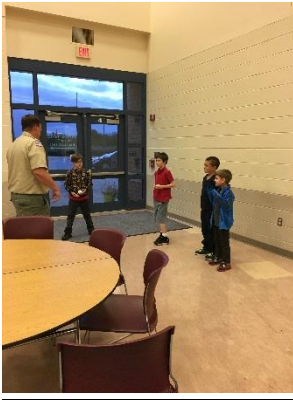
Boy scouts are meeting at Southwest! 1 st through 4 th grade boys are welcome!